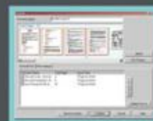
Page Composer Screen