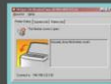
NetSpot Job Monitor-Status Notification Device