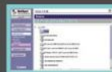
NetSpot Accountant-Device List Display