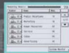
User Mail Box Screen

Secured Print – Permits entry of a confidential PIN from within the print driver. Printing will begin only upon user-entry of his/her confidential PIN number at the device.