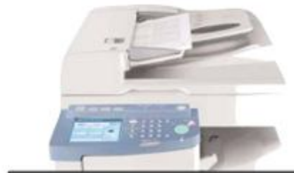
Duplexing Automatic Document Feeder