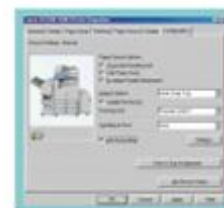
Print Driver Device Configuration Tab