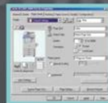
Print Driver Page Setup Tab