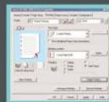
Driver Properties Finishing Tab