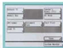
Fax Screen Special Features