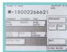
Main Fax Screen