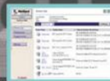
NetSpot Console Device List Selection

Canon's pioneering efforts in creating the digital multifunction marketplace has provided us with a considerable advantage in identifying emerging customer needs. This experience, combined with our exhaustive funding of new research and development, has allowed us to assume a